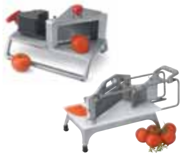
Tomato Pro™ & InstaSlice™ • 3-1/2" tomatoes