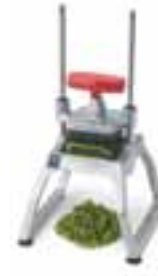
InstaCut 5.0, InstaCut 3.5, Tabletop or Wall Mount • Onions, Celery, Peppers, Tomatoes, Potatoes, Apples, Pears