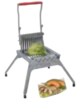
Lettuce King® I • 1/4 Lettuce, 1/2 3" onion, 1/2 bell pepper, cucumbers