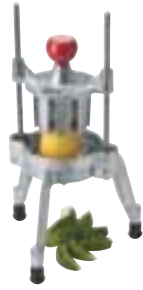
Wedgemaster® & Wedgemaster® II • Lemons/Limes, Oranges, Tomatoes